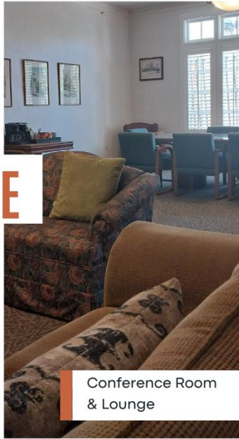
Conference Room & Lounge